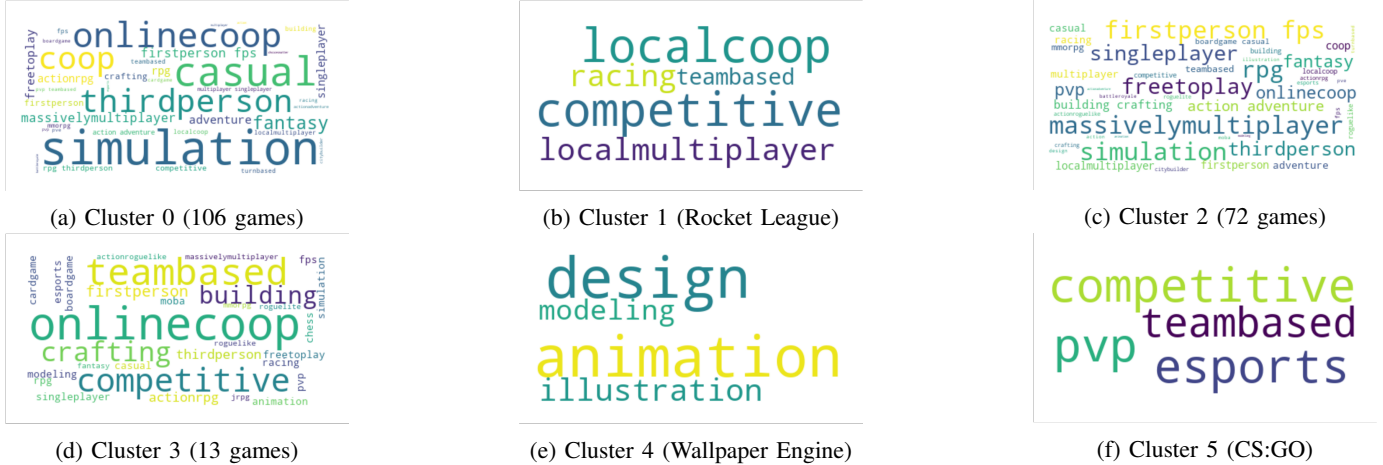
Fig. 2: Word clouds for the 5 game clusters, displaying the frequency of the user-defined tags in Steam.

highest. The games in the cluster present a centralized structure , in terms of degree. The nodes, on average, present a high degree distribution but very variable ( mean = 60 , and std = 145 ).